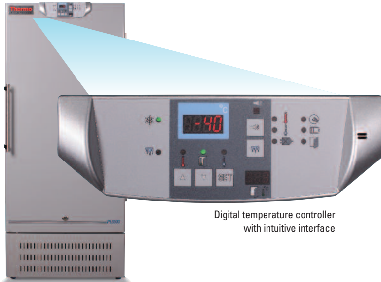
Digital temperature controller with intuitive interface