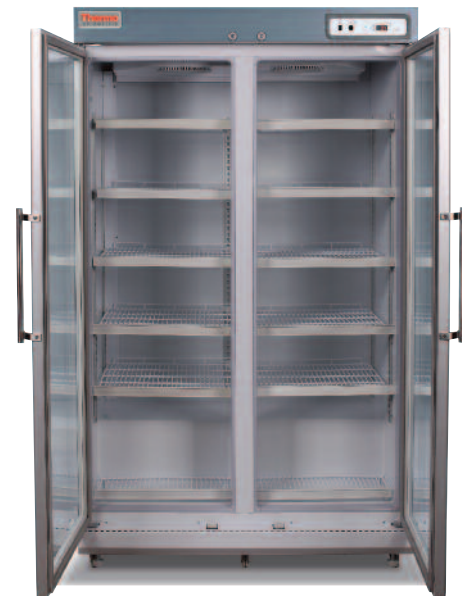
Shown left to right: Lab refrigerators PLR221, PLR386, PLR1006; Lab freezer PLF276