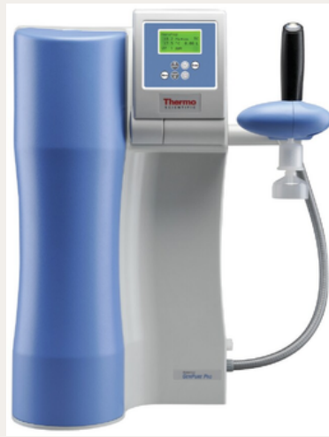
GenPure Pro Type 1 water