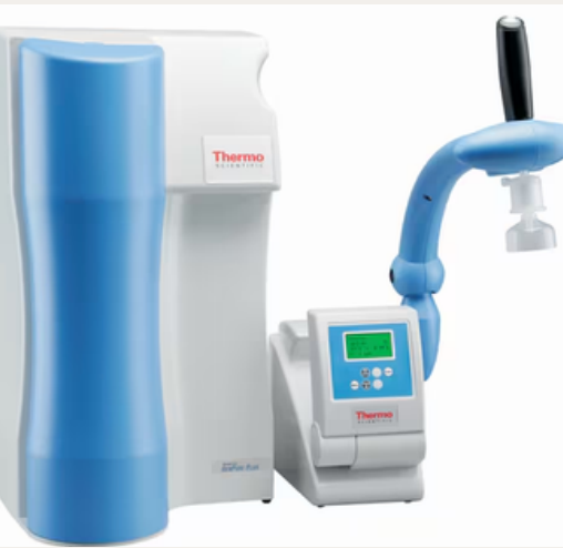
GenPure Plus Type 1 water