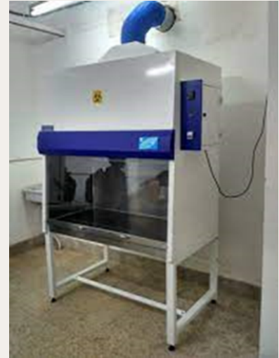
Bio safety Cabinet