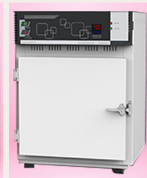
Hot Air Oven