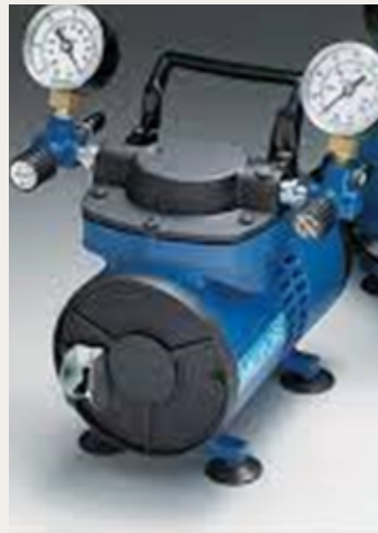
Chemical Duty vacuum cum pressure pump