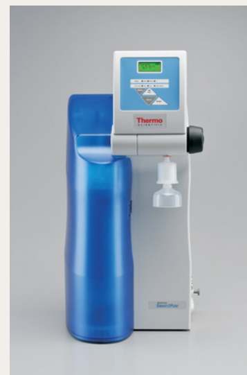
Smart2Pure Type 1&2 water