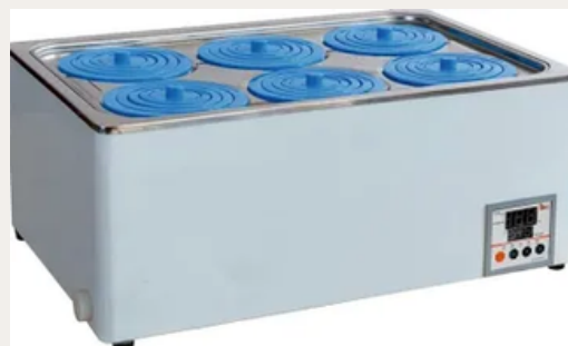
Digital Water Bath