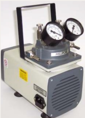
Vacuum cum Pressure Pump