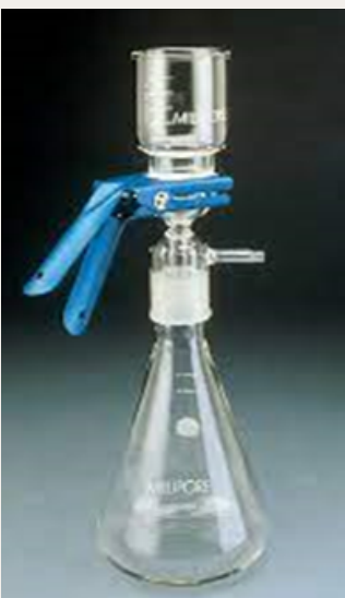
All Glass Filter Holder