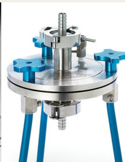
142 mm Filter Holder