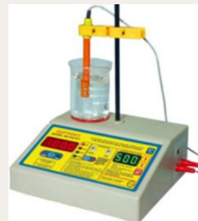
TDS cum Conductivity meter