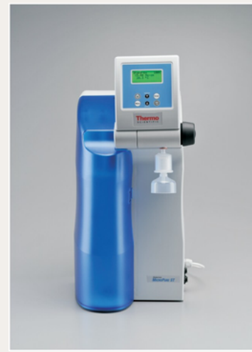
MicroPure Type 1 water