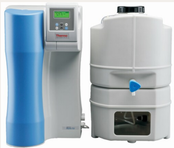
Pacific TII Type 2 water