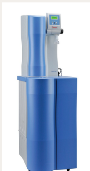
LabTower EDI Type 1&2 water

Brand: Thermo Fischer Scientific Barnstead