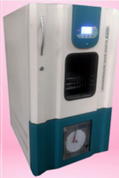
Deep Freezer (-20/-40/-80 C)