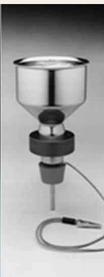
SS Filter Holder