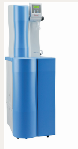
LabTower Type 2 water

Brand: Thermo Fischer Scientific Barnstead